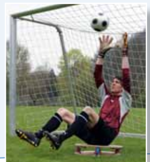
Vestimed® in sport activities