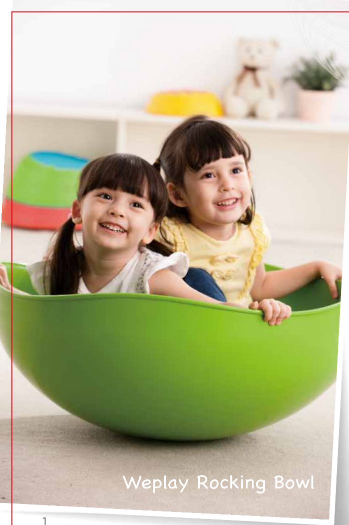
Weplay Rocking Bowl