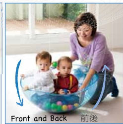
Front and Back 前後