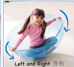
Left and Right 左右