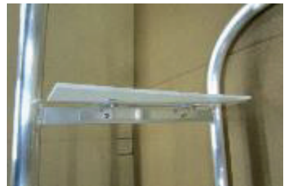
fix board projecting to the inside