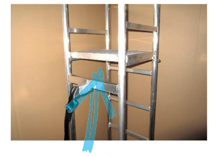
unscrew ring bolt to change platform height